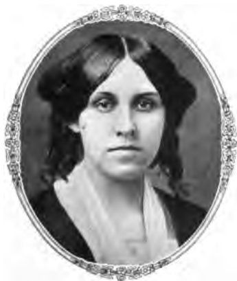
LOUISA MAY ALCOTT